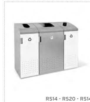
RS14 - RS20 - RS14