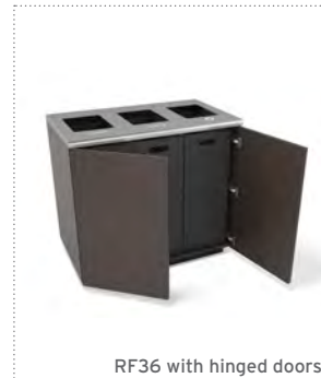
RF36 with hinged doors.