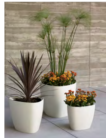
TRP2420 - TRP3024 - TRP2016