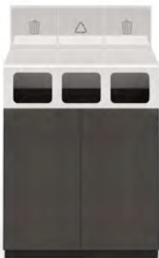
Shown with optional sign panel.