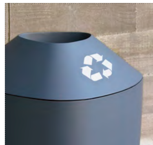
Shown with optional recycling logo.