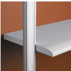
Cool Grey laminate shelf