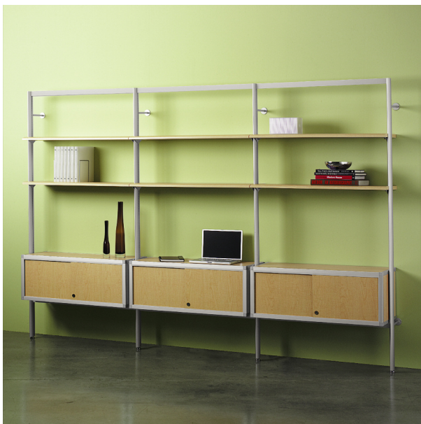
MS3 (3) sections 42"w with locking credenza storage and laminated shelves. Available in unlimited lengths with additional 'Add-On' sections. 123w x 84h x 15d

Of course, custom configurations are available.