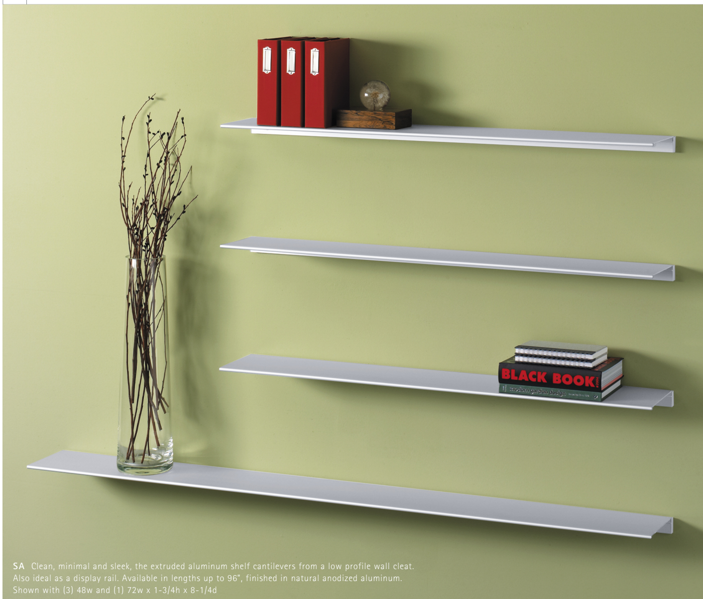
SA Clean, minimal and sleek, the extruded aluminum shelf cantilevers from a low profile wall cleat. Also ideal as a display rail. Available in lengths up to 96", finished in natural anodized aluminum. Shown with (3) 48w and (1) 72w x 1-3/4h x 8-1/4d