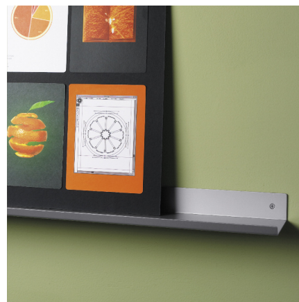
PR Presentation Rail available in lengths up to 96w x 2h x 5-1/2d.