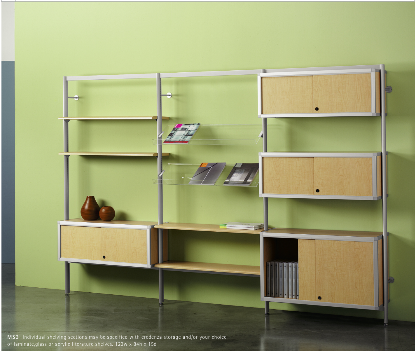
MS3 Individual shelving sections may be specified with credenza storage and/or your choice of laminate, glass or acrylic literature shelves. 123w x 84h x 15d