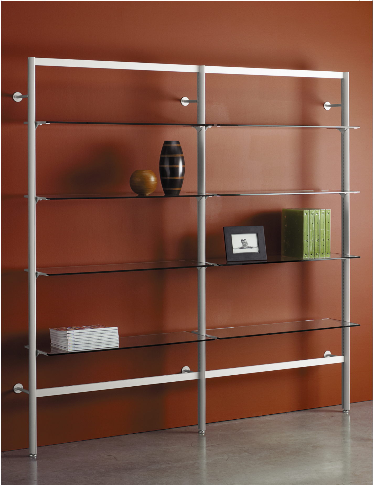
MS2 (2) sections 42"w with glass shelving. 83w x 84h x 13d