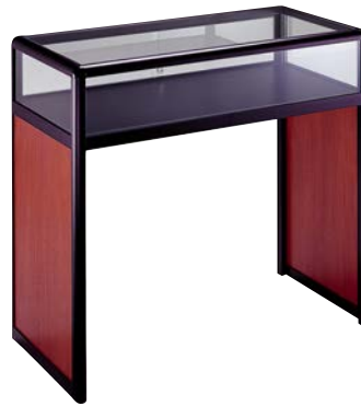
PMC-TP 483820 48w x 38h x 20d