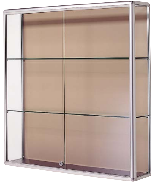
MMW 36367 MiniMint 36w x 36h x 7d