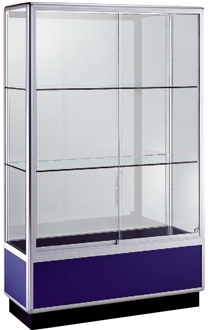
PMS-B 487218 48w x 72h x 18d