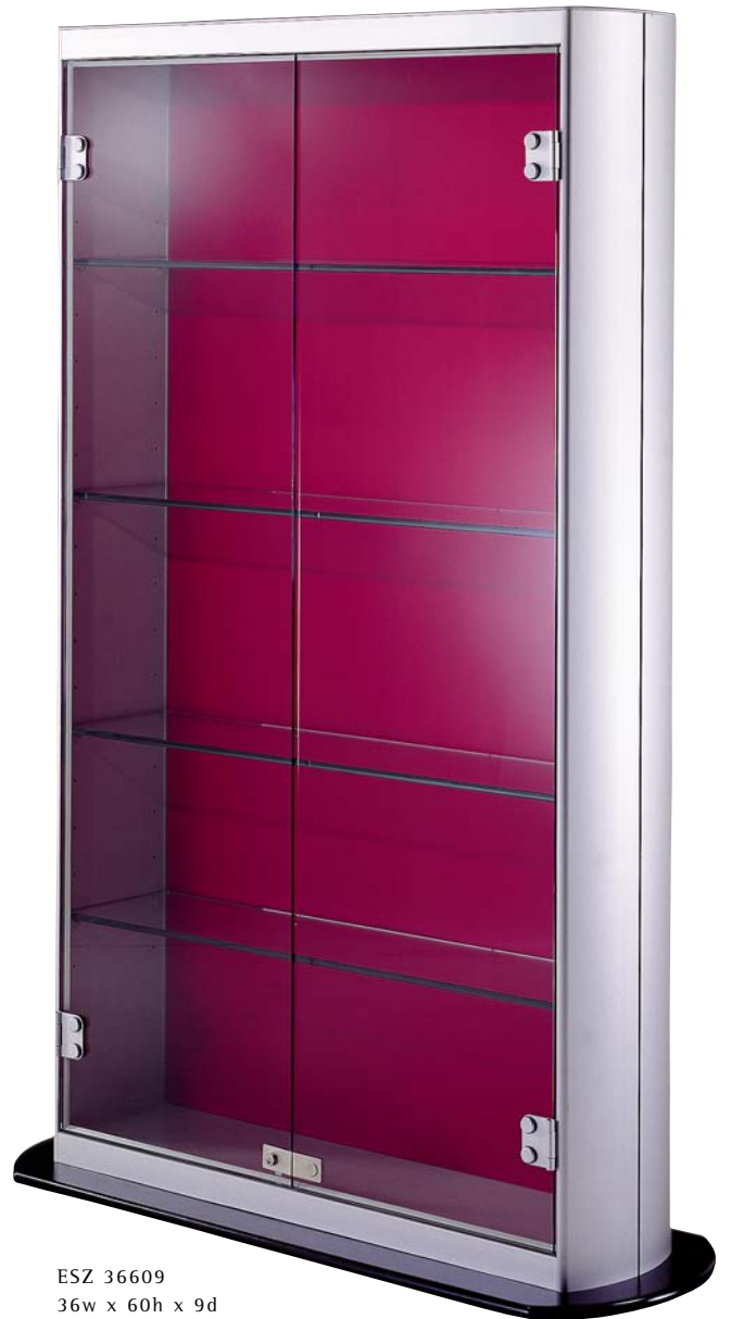
ESZ 36609 36w x 60h x 9d