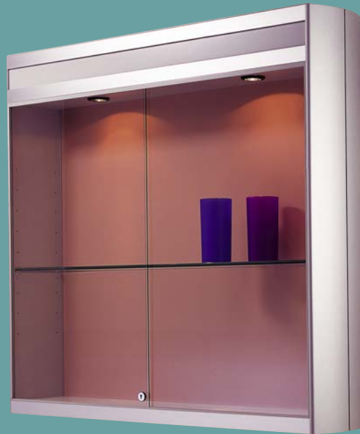
ESW-S 48429 Shown with recessed xenon lighting. 48w x 42h x 9d

These showcases provide for efficient presentation of priceless, precious, delicate pieces at various viewing levels. Incorporating the sleek elliptical profile frame, all cases are furnished with tempered safety glass, adjustable polished glass shelving and sliding, lockable doors. Optional lighting available.