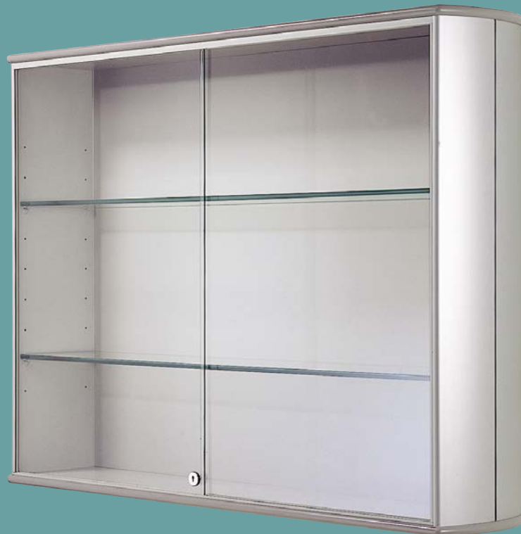
ESW 48369 48w x 36h x 9d