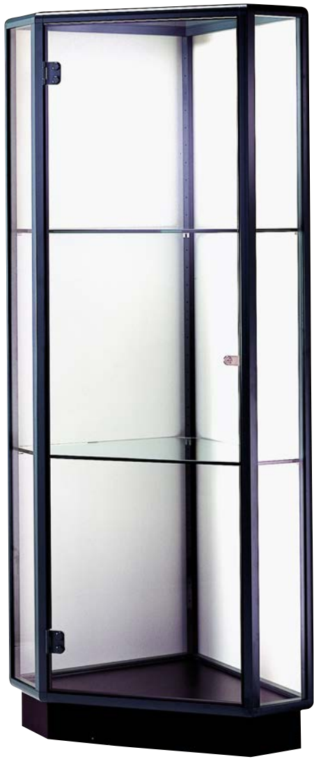
PMS-C 24728 24w x 72h x 24d

Quarter-Circle and Corner Cases offer unrestricted viewing of any object. The quarter round frame is available in natural or black anodized aluminum or any PPP color. Furnished with tempered safety glass, adjustable polished glass shelving and locking doors. Lighting systems, plinths and accessible storage areas are optional.