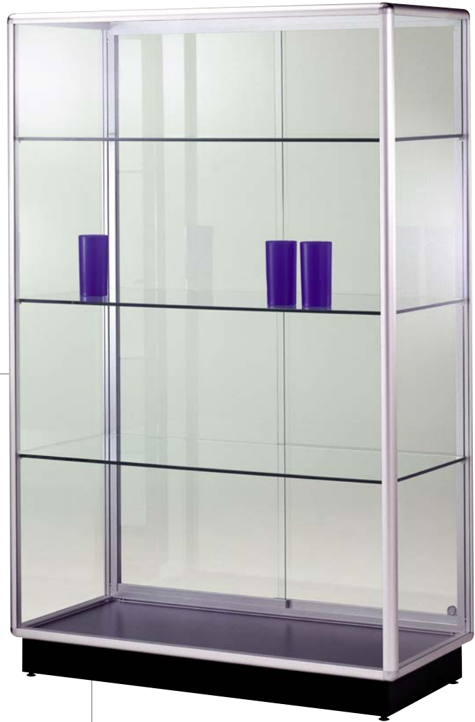
PMS-GL 487224 48w x 72h x 24d