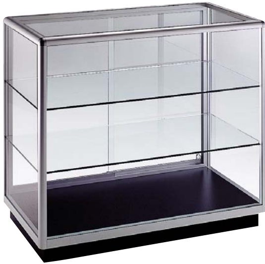
PMC-GL 484224 48w x 42h x 24d

Smaller displays using the petite quarter round frame for placement on an existing fixture or pedestal.