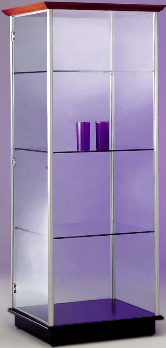
US 307230-T 30w x 72h x 30d

The PepperMint and MiniMint Showcase Collection presents a solution for showcasing important articles and documents in Freestanding, Wall mounted and Countertop display cases. Designed to function in places where people gather, they will accommodate products for sale or display. The handsome profiles of these cases add style and distinction to any interior, while enhancing the value of their contents. Custom designs and configurations offer no limit to your imagination.