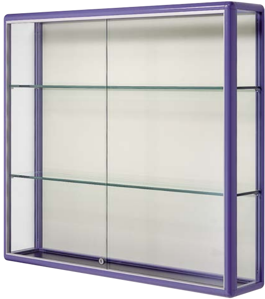
PMW 48429 48w x 42h x 9d

The PepperMint and MiniMint quarter round profile frames are available in natural or black anodized aluminum or any PPP color. Optional low voltage xenon and fluorescent lighting is available. Furnished with tempered safety glass, adjustable polished glass shelving and sliding lockable doors.