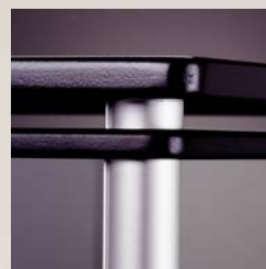
Spacer top (S)