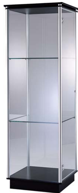
US 247224-S 24w x 72h x 24d