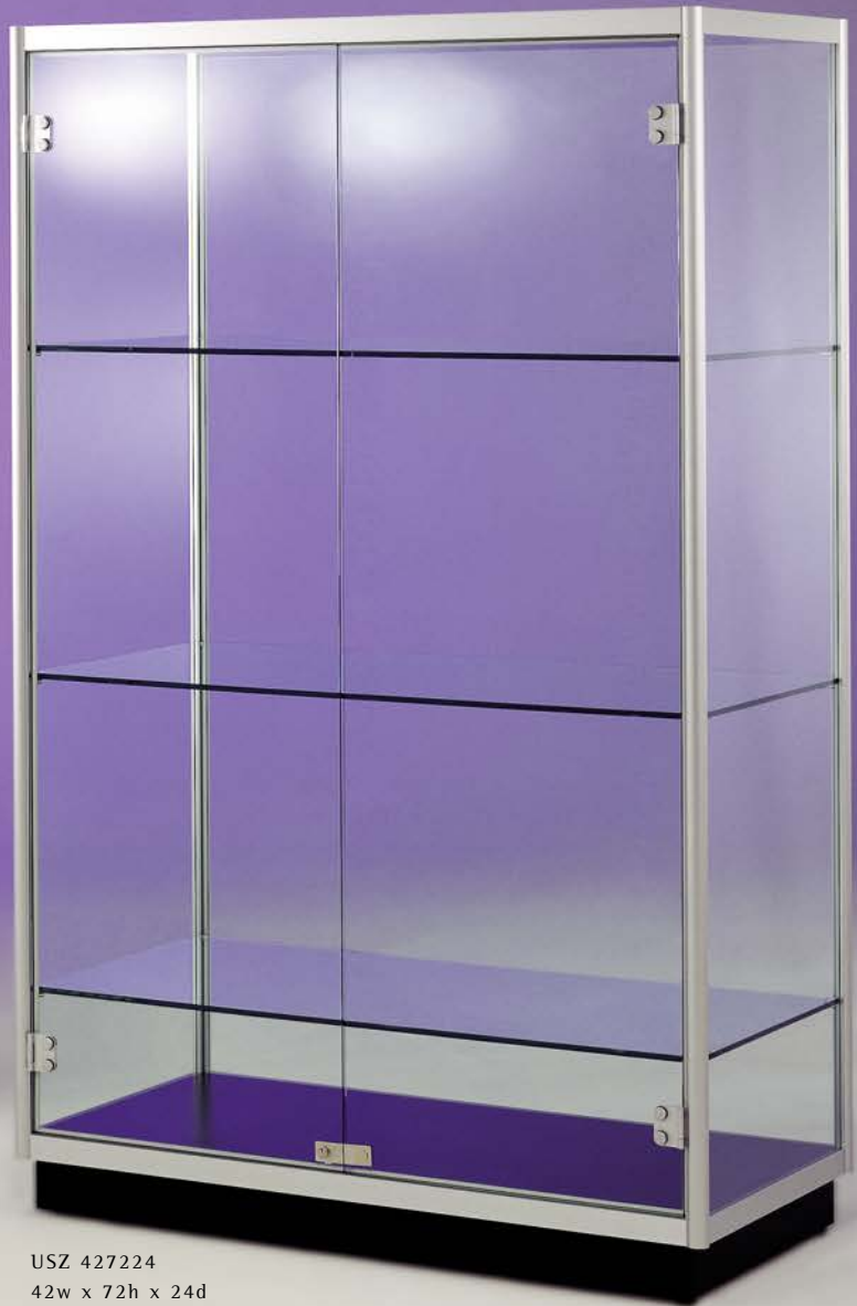
USZ 427224 42w x 72h x 24d