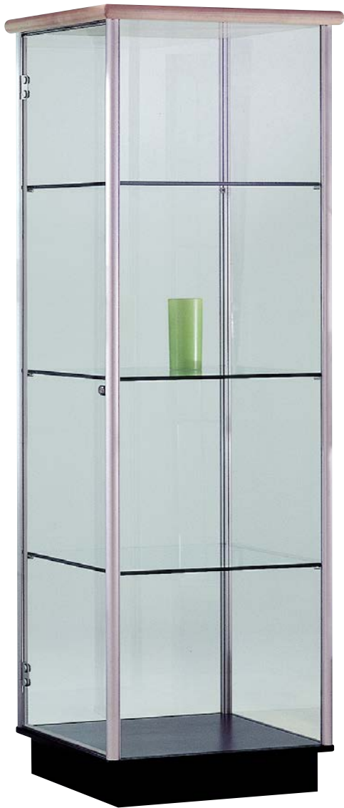
US 247224-B 24w x 72h x 24d

This Collection combines the warmth of wood and glass, with the elegance of the circular natural anodized aluminum profile. A selection of tops are available in rich wood finishes or any PPP color. Furnished with tempered safety glass, adjustable polished glass shelving and lockable doors. Xenon lighting and plinths are optional.