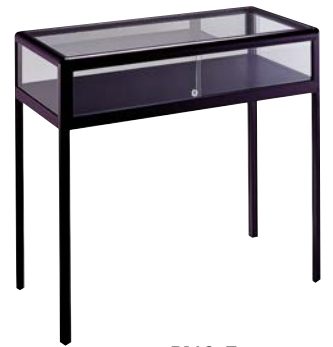
PMC-T 483820 48w x 38h x 20d