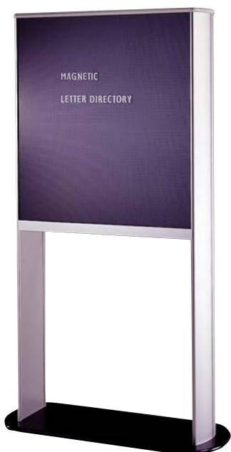
ED-1 32689-R 32w x 68h x 9d

See Master Price List Section 10 for specifications.