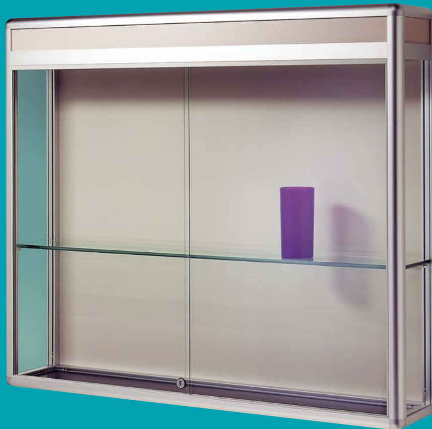
PMW-S 48429 48w x 42h x 9d