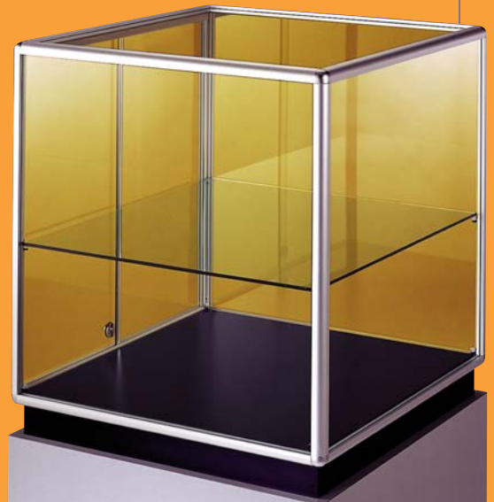
MMC 242424 MiniMint 24w x 24h x 24d